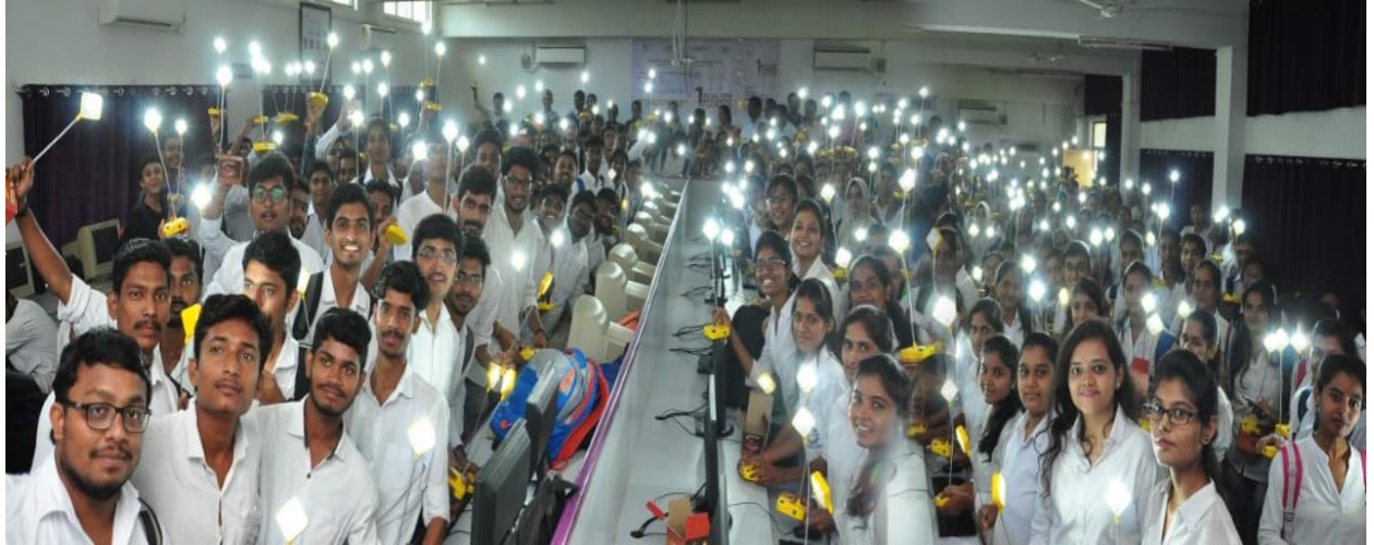
Group Photo after making Solar Lamp