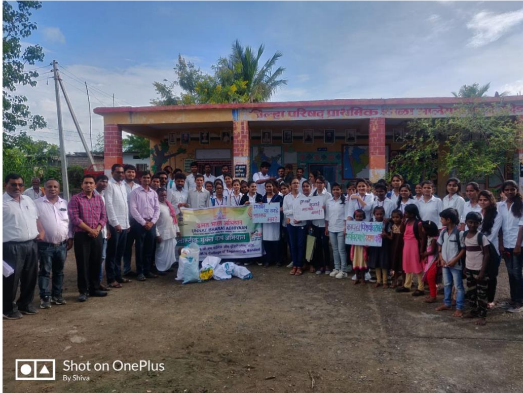
student collected plastic from Pimpri mahipal village