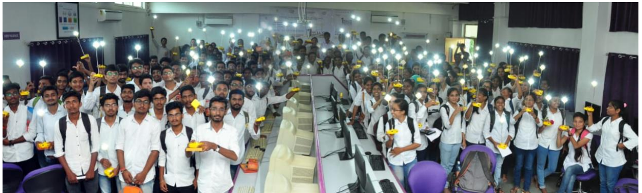
Group Photo after making Solar Lamp