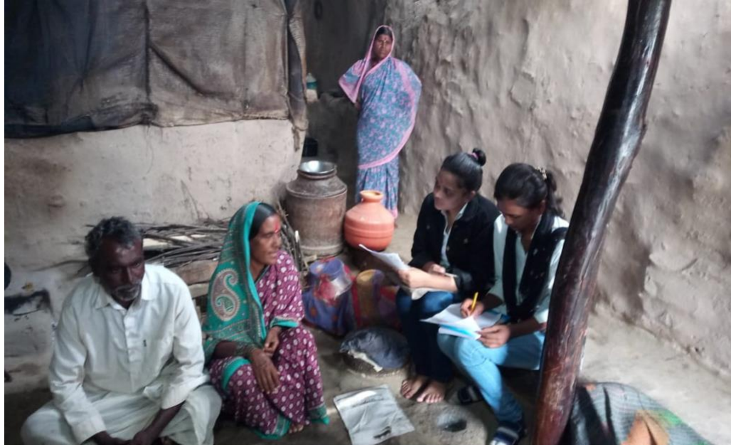
Student conducting household survey in Alegaon village