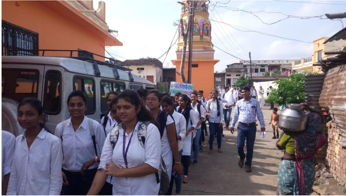
student done awarens rally in Khadki village