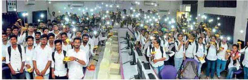
नांदेड : 'एमजीएम'मध्ये 'सोलर अॅम्बेसेडर' कार्यशाळा पार पडली.