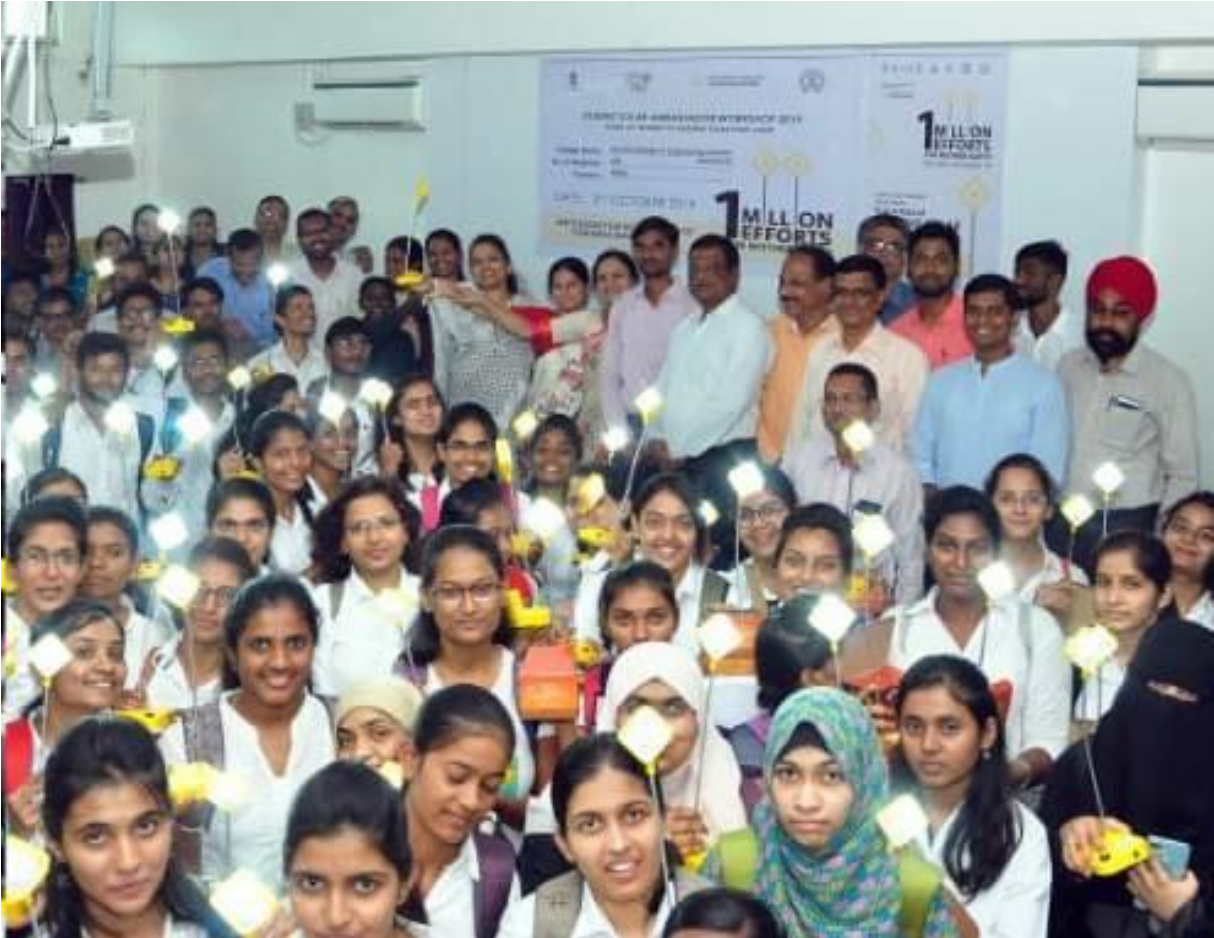
Group Photo after making Solar Lamp