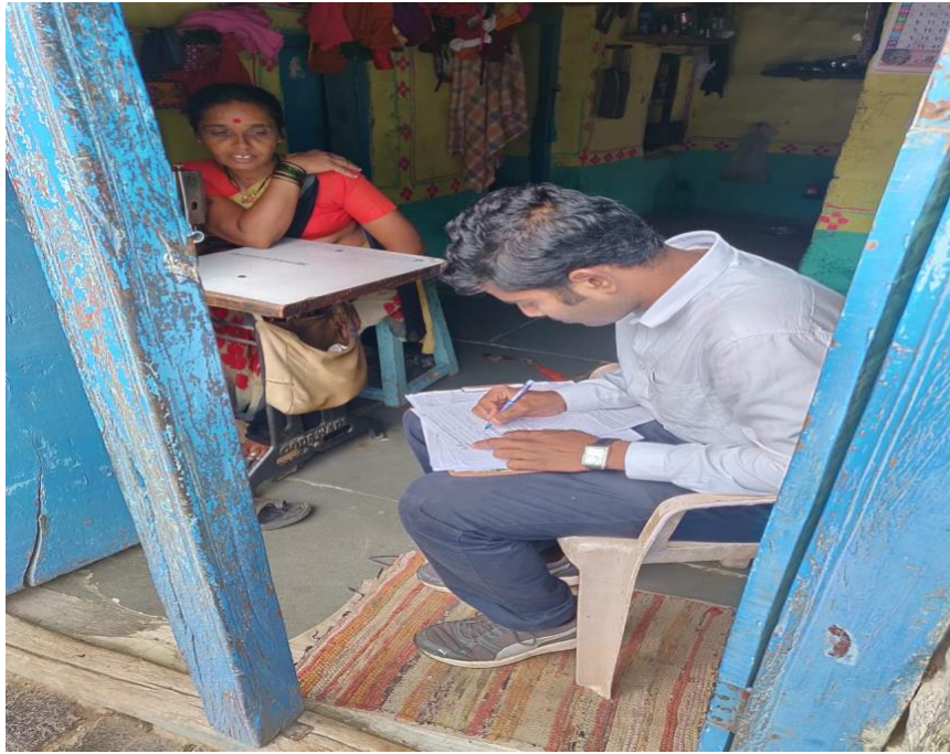
Student conducting household survey in pimpri mahipal village