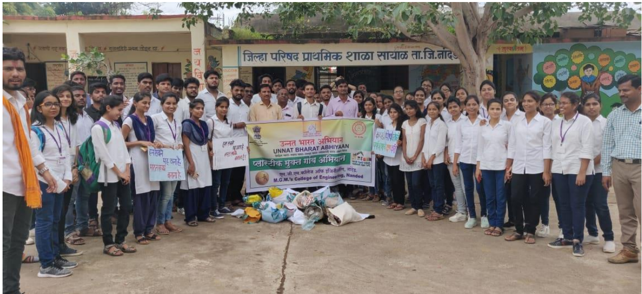
Collected plastic from Sayal village village