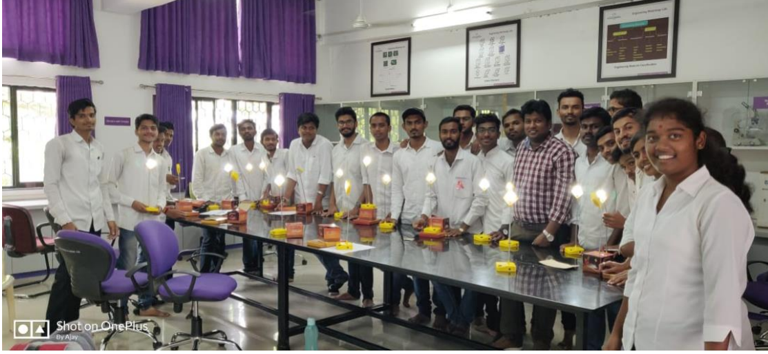
Group Photo after with trainer and student