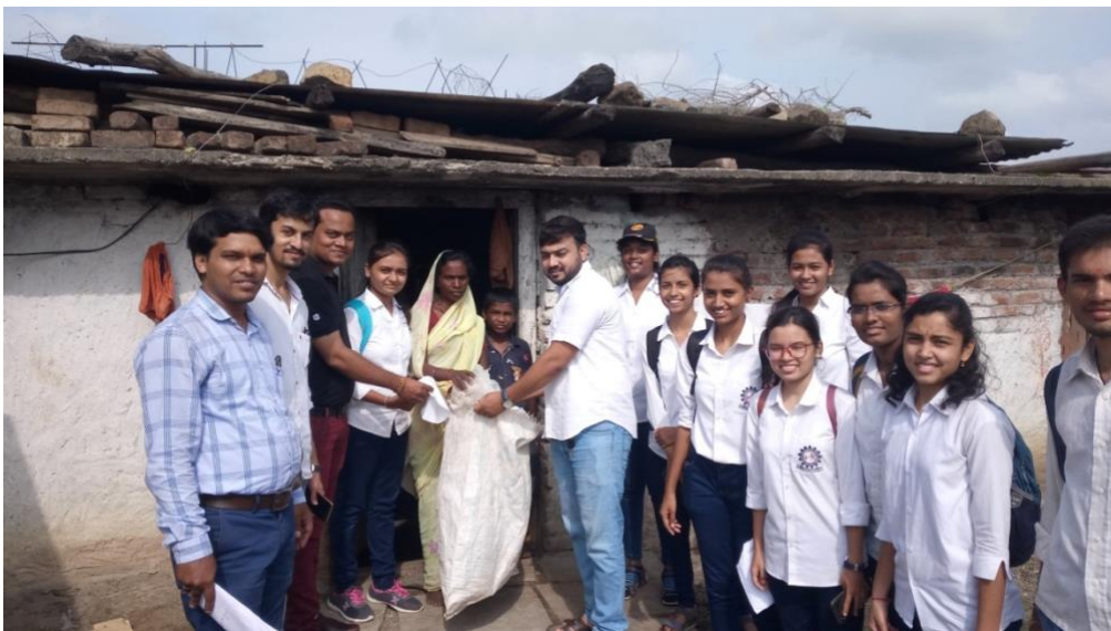
student collecting plastic from Wadavan village