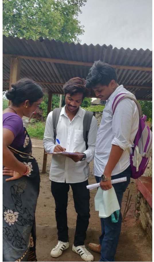
Student conducting household survey in Khadki village