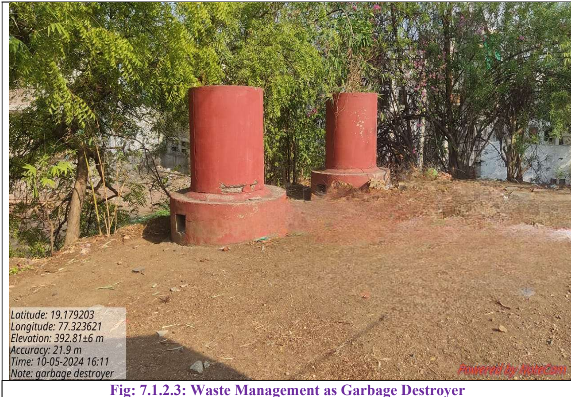
Fig: 7.1.2.3: Waste Management as Garbage Destroyer