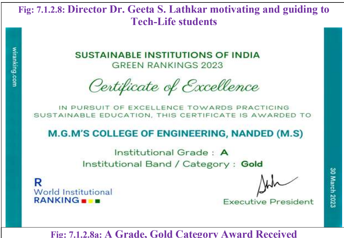
Fig: 7.1.2.8a: A Grade, Gold Category Award Received