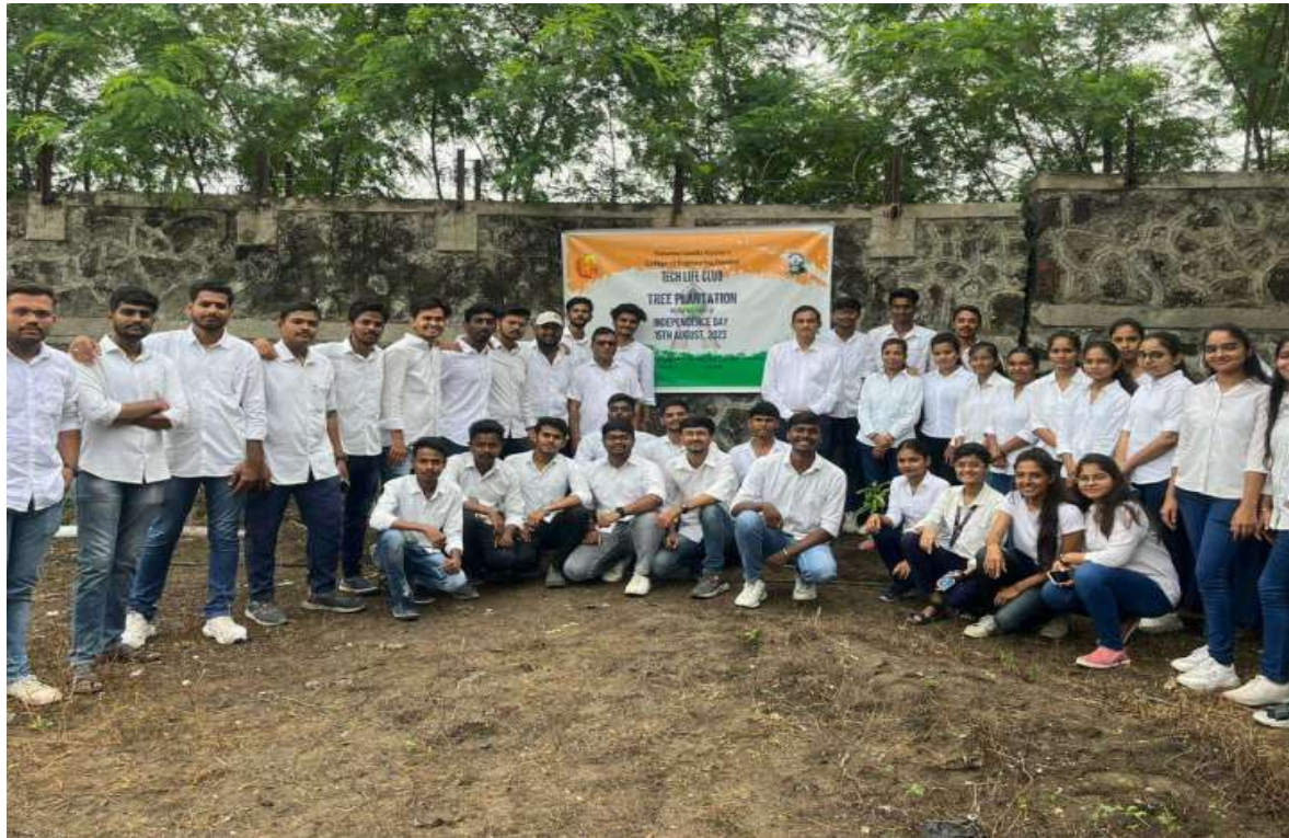
Fig: 7.1.2.5: Teach life team 2023-24 for Tree plantation Programme