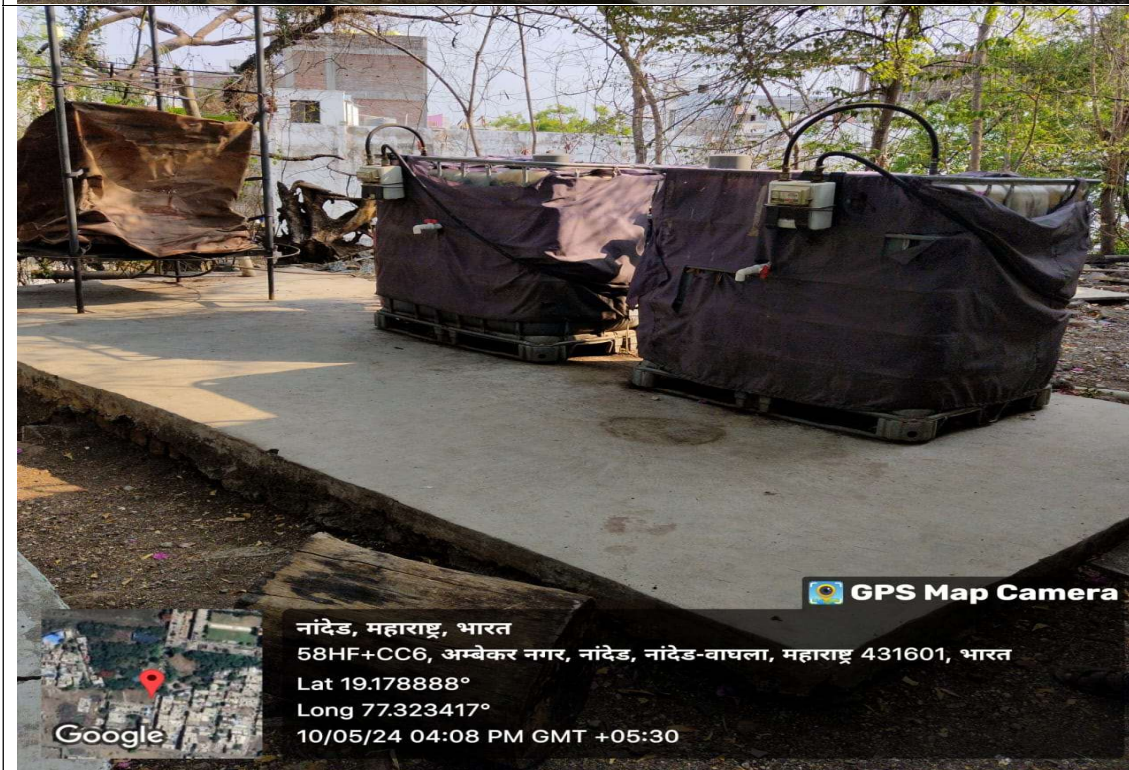
Fig: 7.1.2.2: Degradable and Nondegradable Waste Management Using Bio Gas Plant