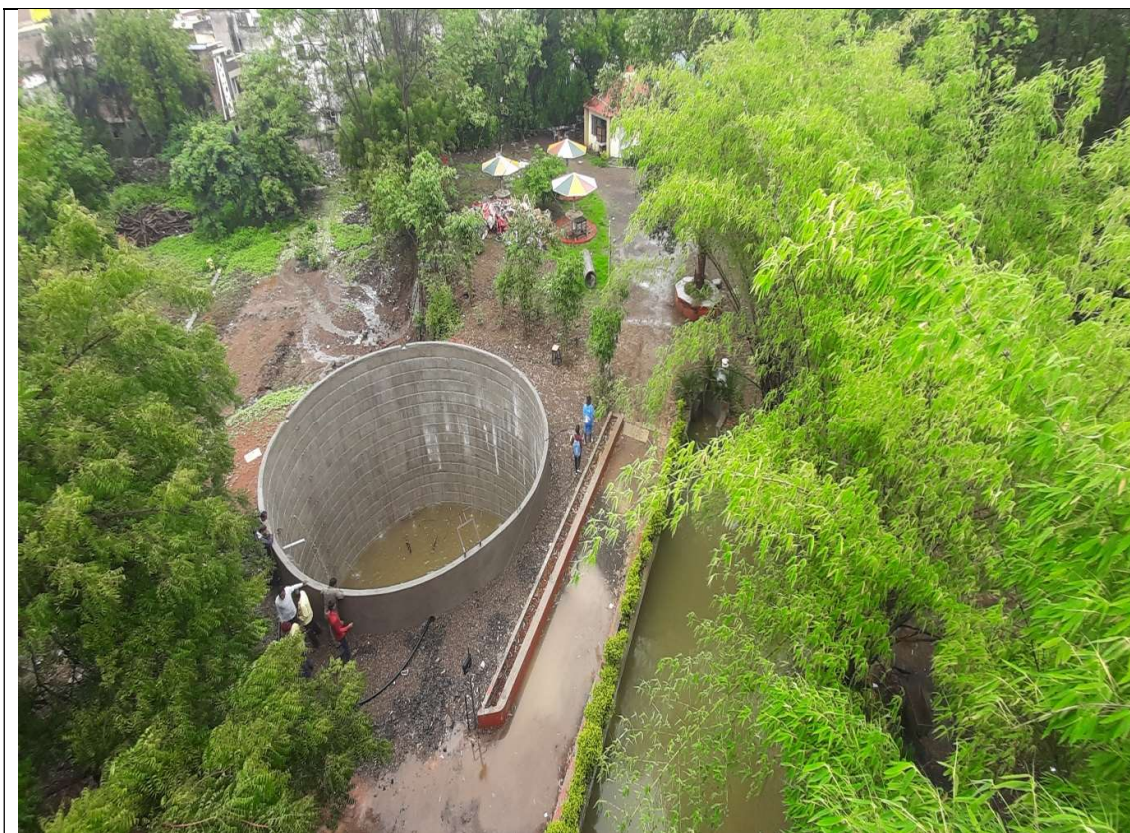
Fig: 7.1.2.4a: Water conservation as Well