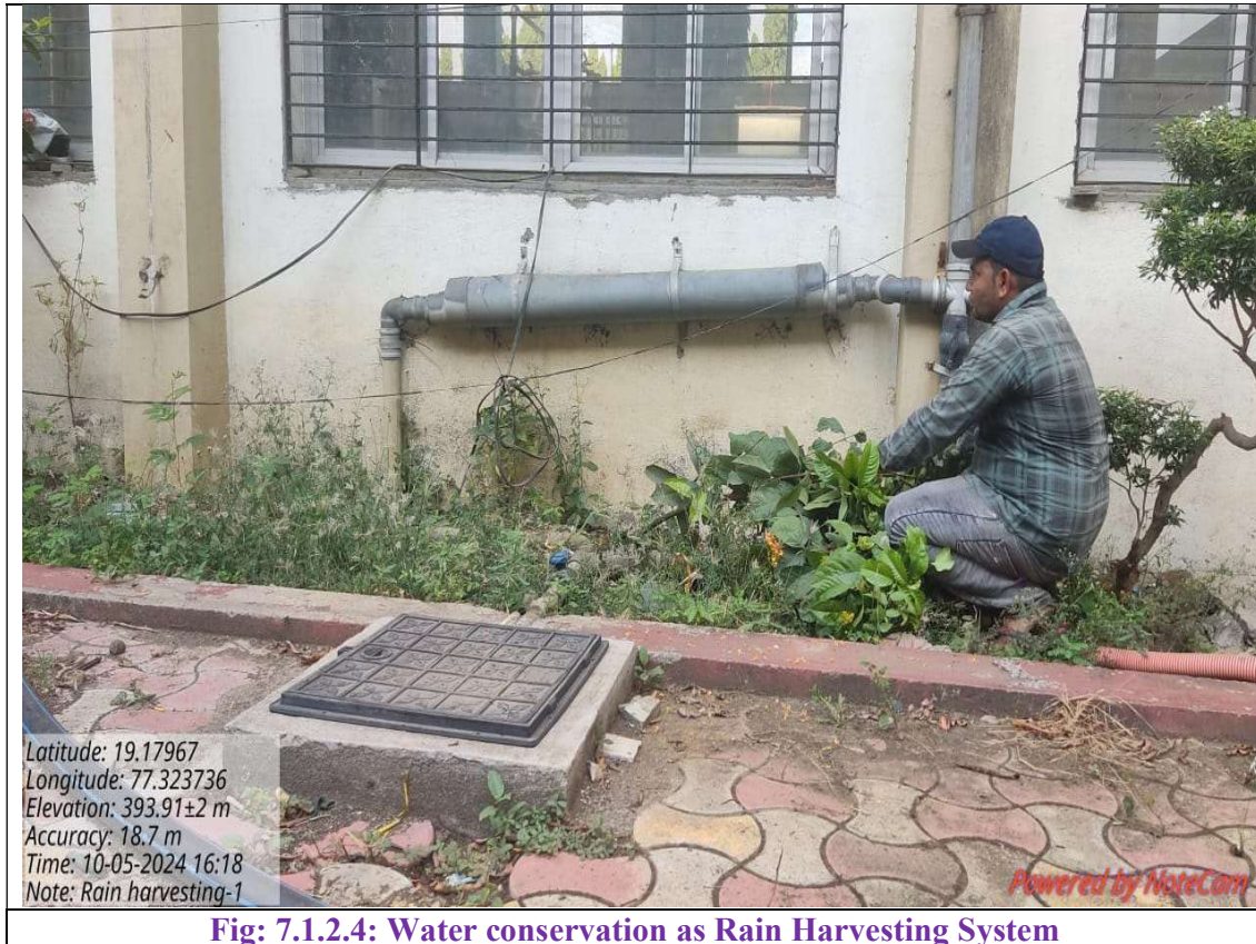
Fig: 7.1.2.4: Water conservation as Rain Harvesting System