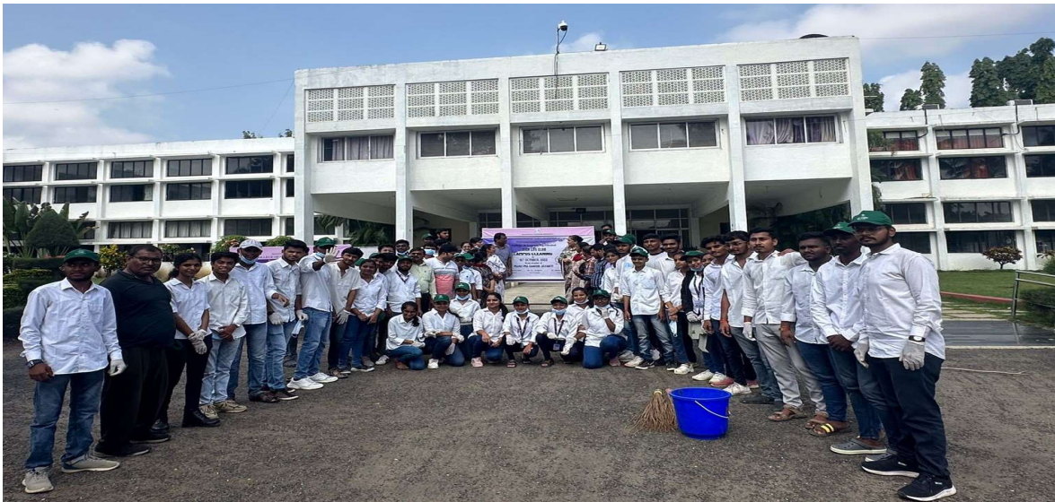
Fig: 7.1.2.7: CAMPUS CLEANING DRIVE WITH TECHLIFE CLUB