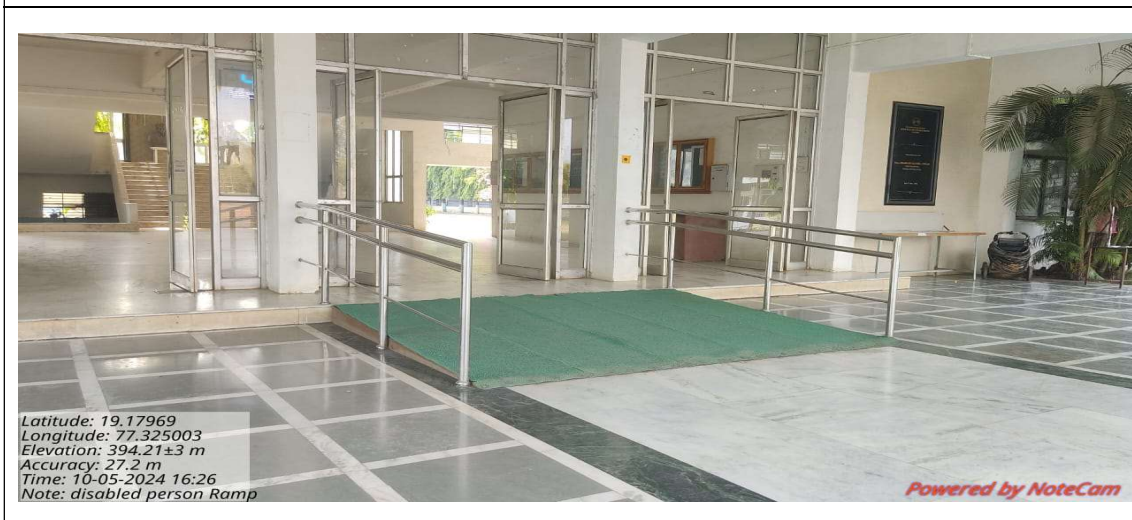
Fig: 7.1.2.9: Disabled-Friendly, Barrier Free Environment as Ramp