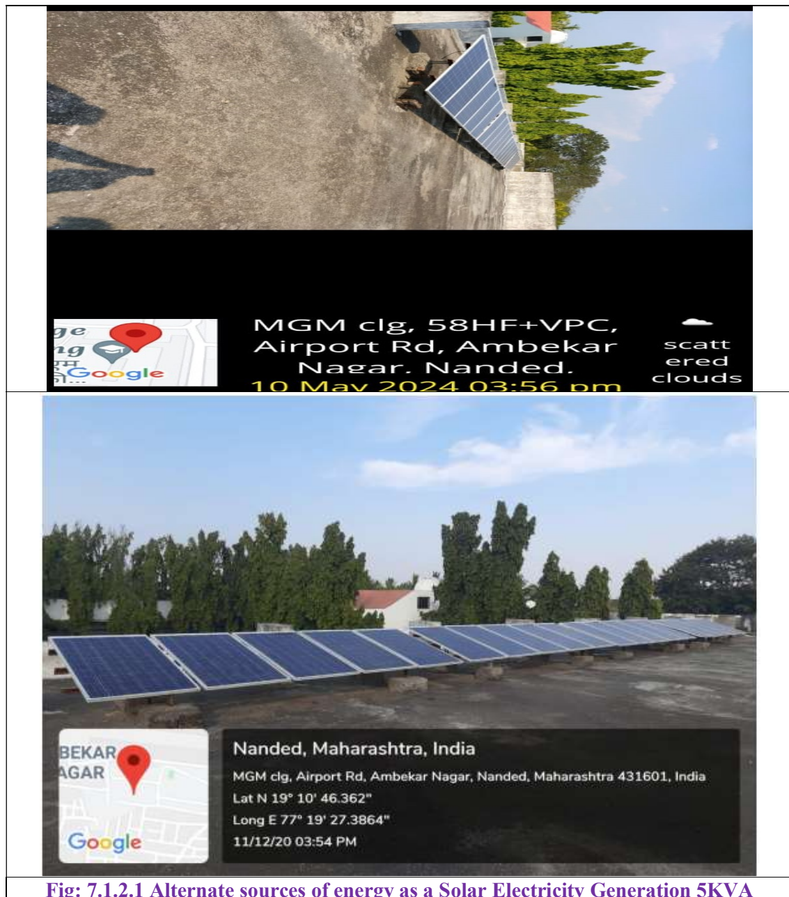
Fig: 7.1.2.1 Alternate sources of energy as a Solar Electricity Generation 5KVA